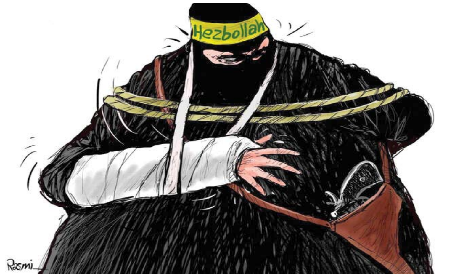
Cartoon by Amjad Rasmī. (Courtesy of Asharq Al-Awsat)

The year 2026 marks a critical juncture in Beijing’s push to establish itself as a world-class tourism destination and a premier stop for global travelers in China. The city will continue to promote the development of inbound tourism by focusing on three priorities: upgrading the quality of its tourism products, raising the international standard of its services, and diversifying its promotional outreach.