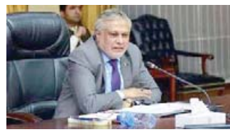
ISLAMABAD: Deputy Prime Minister / Foreign Minister Senator Mohammad Ishaq Dar Monday spoke with EU High Representative/Vice President Kaja Kallas.

They expressed deep concern on the recent regional developments in Iran and the wider Middle East.