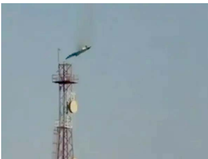
sources. An AFP correspondent saw black

He stated that authorities are continuing investigations to determine the causes of the incidents, urging the public and media to rely only on information from official