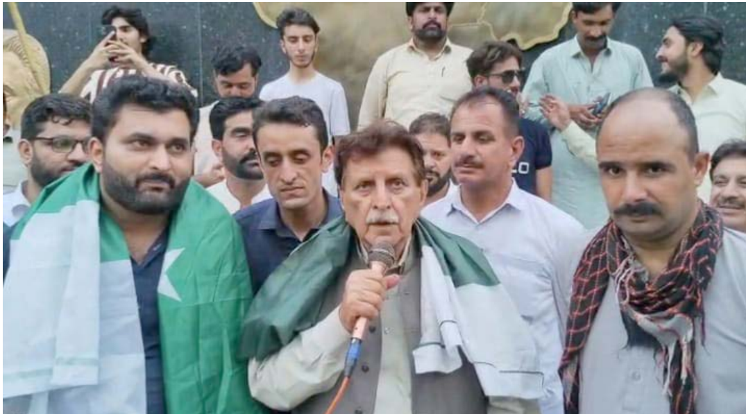
He said that youth group belonging to four provinces of Pakistan will sacrifice for our protection. He made it clear that we did not