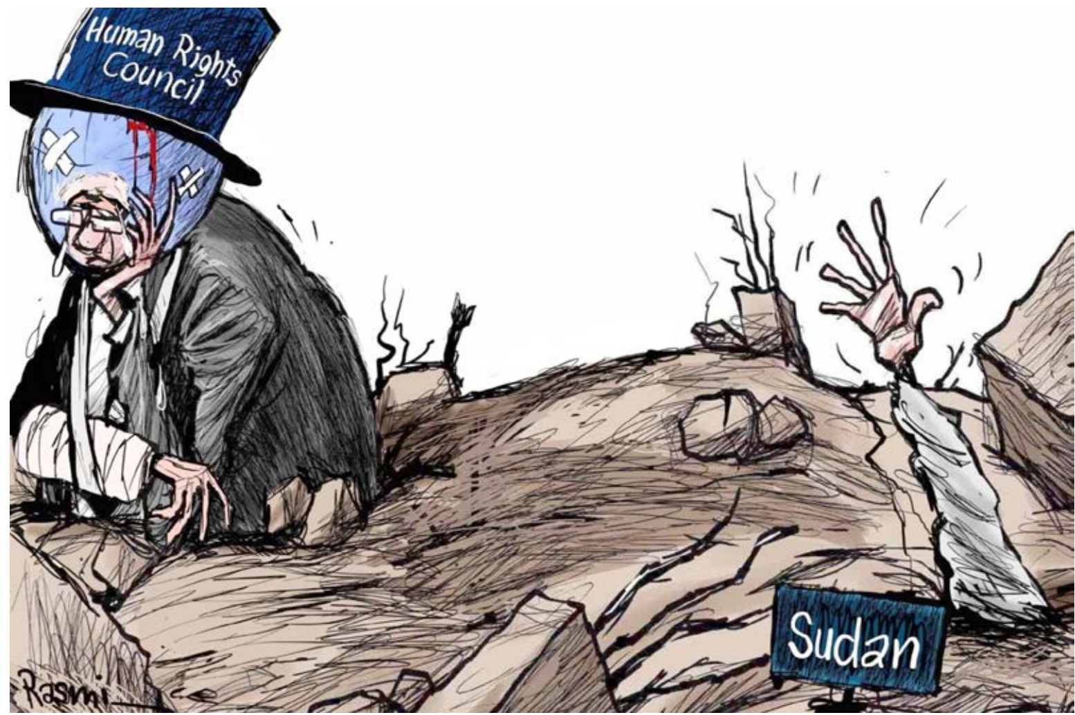
Cartoon by Amjad Rasmī.

In conclusion, the author warns that, despite periodic cease-fire efforts, the humanitarian crisis remains unresolved. The article argues that without meaningful international action, the conflict is likely to continue, with devastating consequences for civilians. It calls for greater global attention to protecting civilian lives, upholding international humanitarian law, and pursuing a lasting political solution to end the violence and address the underlying causes of the conflict.