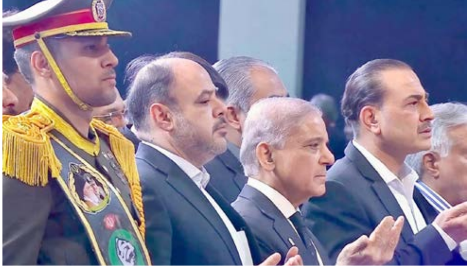
Sharif, Deputy Prime Minister and Foreign Minister Senator Muhammad Ishaq Dar, Field Marshal Syed Asim Munir, Chief of Army Staff and Chief of Defence Staff, Chairman of Senate Syed Yousaf Raza Gilani, Speaker National Assembly Sardar Ayaz Sadiq, Federal

The Ambassador conveyed special thanks to Prime Minister Muhammad Shehbaz