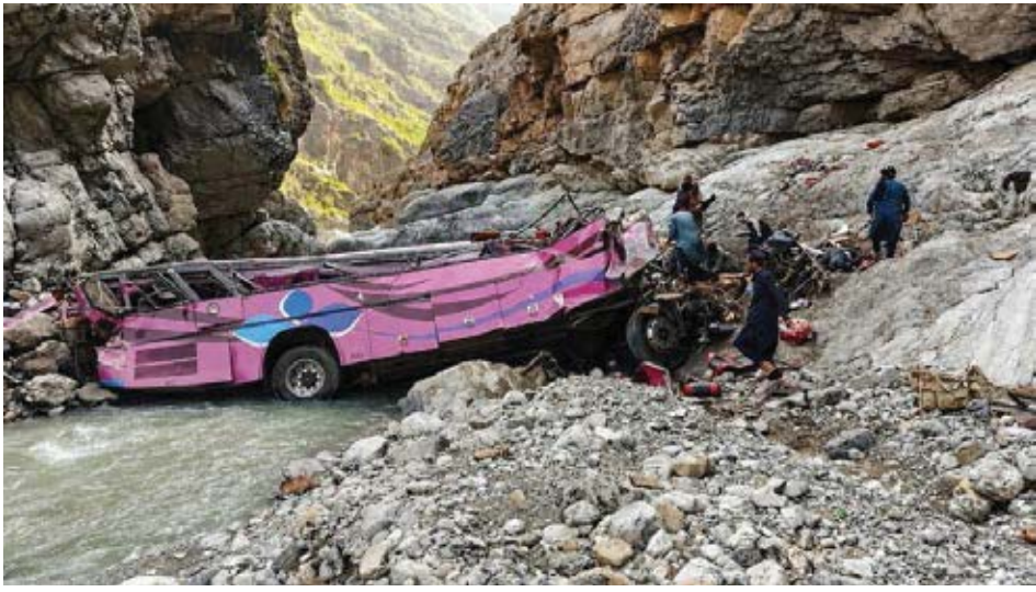
bodies were transported for identification. Hospital officials said the bus had become overcrowded after picking up passengers from another bus that had broken

ZHOB: A tragic road accident claimed the lives of at least 40 passengers and left eight others injured when a Peshawar-bound passenger bus plunged 70 to 80 feet into a deep ravine near the Dhanasar area on the Balochistan-Khyber Pakhtunkhwa border on Friday. The New Mekhtar bus was travelling from Quetta to Peshawar and was carrying 48 passengers, including women and children. Rescue 1122 teams, police, district administration officials, and local volunteers launched a difficult rescue operation in the rugged mountainous terrain, shifting the injured to the Trauma Centre at Zhob District Headquarters Civil Hospital while the