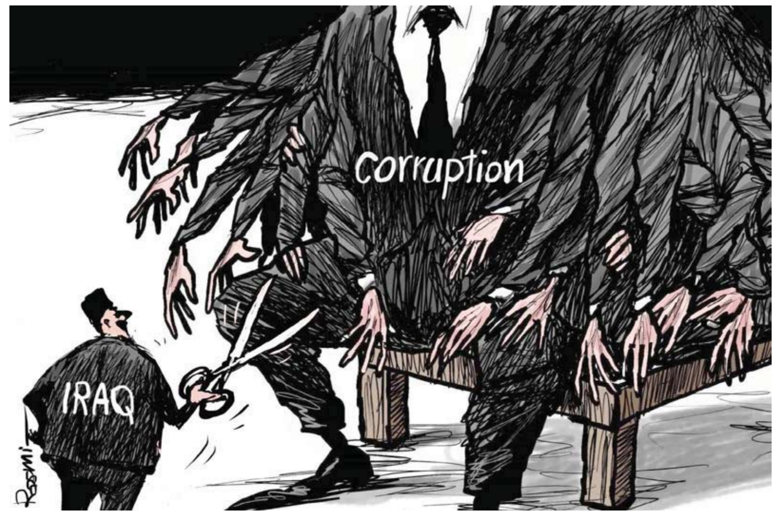
Cartoon by Amjad Rasmī.

Established in 1992, Conference on Interaction and Confidence Building Measures in Asia (CICA) now has 28 member states and 15 observer countries and international organizations, covering more than 90 percent of Asia's territory and representing more than half of the global population. It acts as a key multilateral forum for promoting peace, security and stability in Asia.