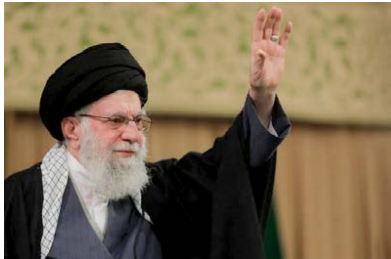
personal capacity, he extends heartfelt condolences to the Parliament, Govern-

Expressing profound grief and sorrow over the demise of Ayatollah Seyyed Ali Khamenei, Chairman Senate Syed Yousaf Raza Gilani stated that, on behalf of the Senate of Pakistan and in his