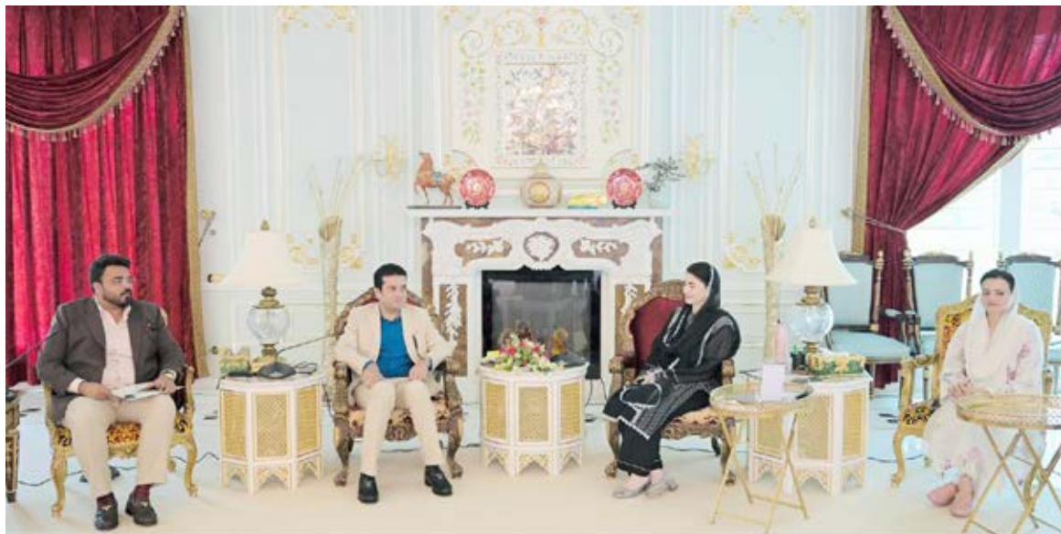
reconstruction and repair of the damaged bridge on the Khaliqabad-Tulamba Road SM Link.

The chief minister also directed the authorities to begin, at the earliest, the