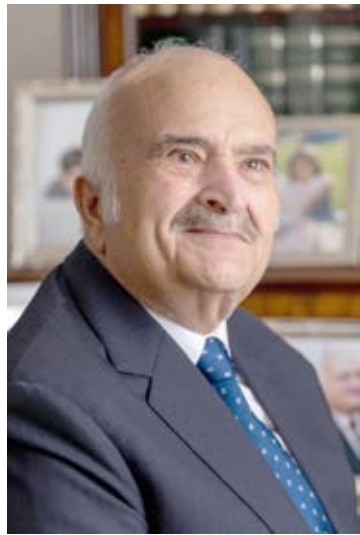
HRH Prince El Hassan bin Talal

With the dawn of a new Hijri year, Muslims do not merely commemorate a historical event of the past. Rather, they draw inspiration from the philosophy of the Hijra as a foundation for deepening awareness and strengthening the values of steadfastness, dignity, justice, the championing of truth, solidarity, and responsibility. These meanings are embodied today in our consciousness as we turn our gaze toward the blessed Al-Aqsa Mosque, the first qibla, which