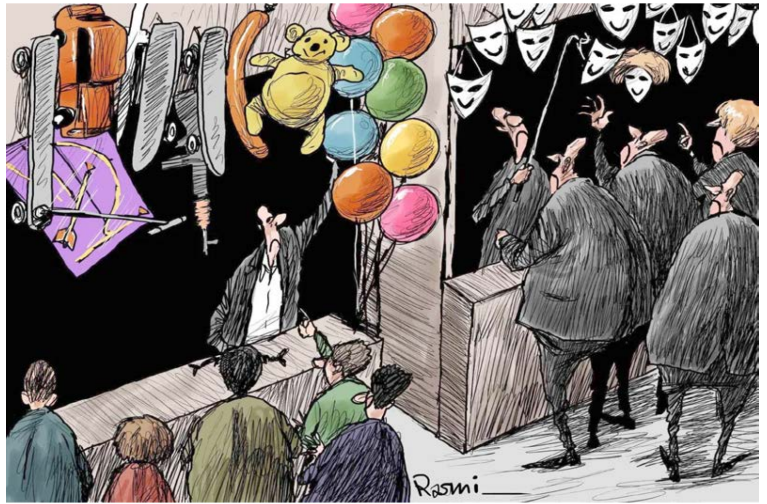
Cartoon by Amjad Rasmi. (Courtesy of Ashfaq Al-Awcat)

Islamabad should immediately prepare a hydrological and legal dossier to test whether the diversion violates treaty provisions on western rivers. The matter should first go to the Permanent Indus Commission, and if needed, to a Neutral Expert or Court of Arbitration. Diplomatically, Pakistan should engage the World Bank and international community, framing this as a regional water security and environmental issue, not just a bilateral dispute. Environmental risks also matter: Indian groups warn that large-scale Himalayan tunneling and dams increase landslide, flash flood and ecological degradation risks. Ultimately, this is about whether international agreements can withstand nationalism, climate pressure and strategic rivalry. The IWT endured 60+ years because both sides kept water insulated from conflict. Preserving that principle is more urgent than ever.