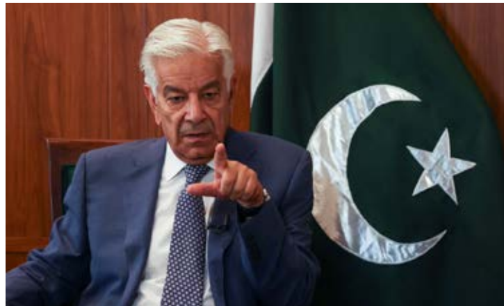
Published by: Almash Ayoub Sabir from Zero Point Printers Rawalpindi

no regard even for me, who was the minister of water and power, and is presently the country's defence minister," he said in his tweet, and wondered that if these employees could hoodwink him, then what would be their attitude towards a common man.