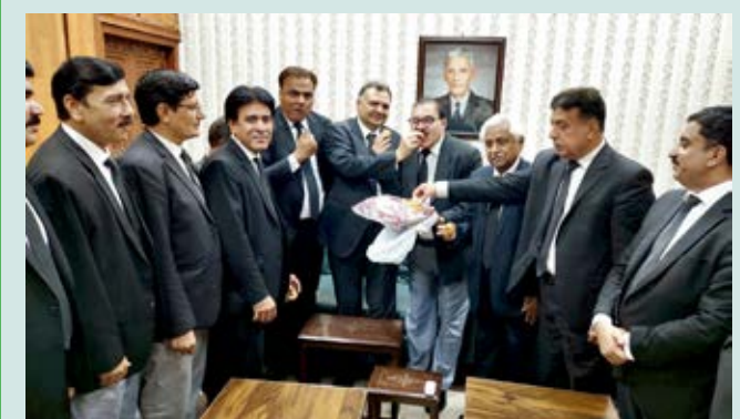
South Punjab Lawyers Distribute Sweets to Mark PPP's Election Win in Gilgit Baltistan.