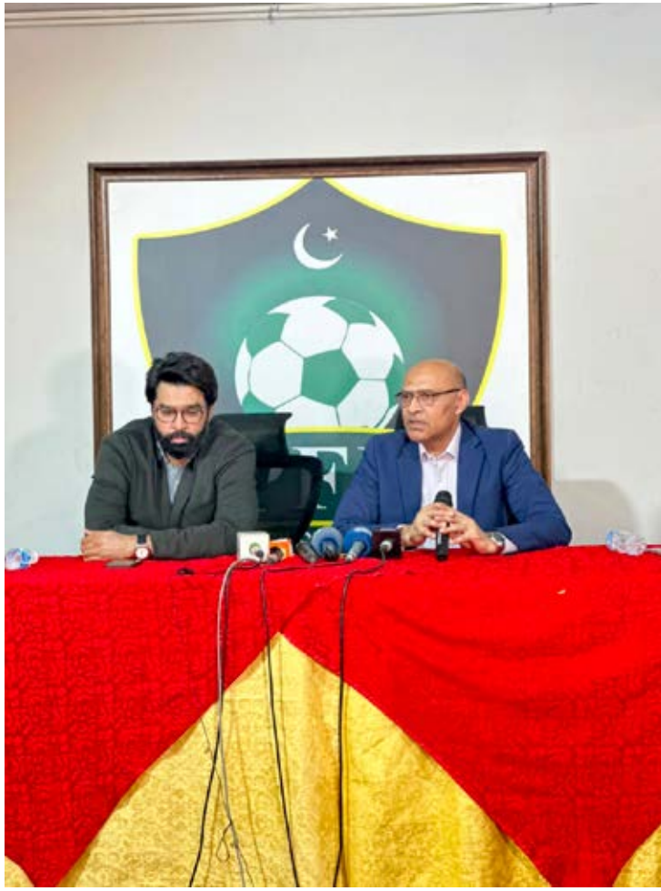
tasked with ensuring the successful execution of the championship. The District Football Championship 2026 is expected to deliver several long-term benefits for Pakistan football, including: Strengthening grassroots and domestic football structures, fulfilling constitutional requirements at the District Football Association level, identification and verification of genuine football clubs, nationwide talent identification and player development, capacity building of District Football Associations, greater coordination between districts, provinces and the PFF and enhanced use of modern technology in competition management.

The COO said that all four provincial football associations and the three regions, Islamabad, Gilgit-Baltistan and Azad Jammu & Kashmir, are represented on a dedicated committee