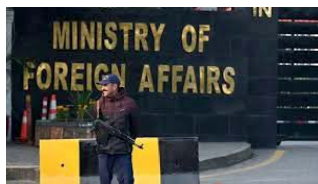
holding colonial-era views should be reminded that Pakistan is a sovereign and democratic state.

"Pakistan believes in the principle of non-interference in the internal affairs of other coun-