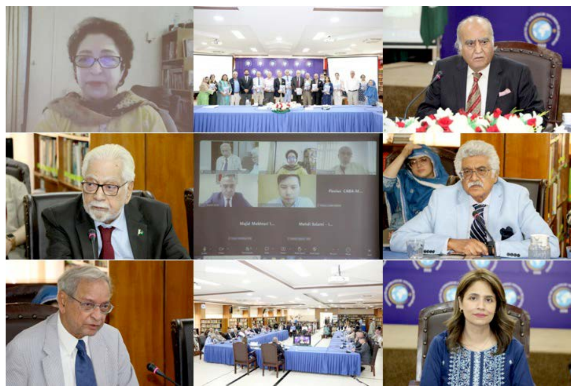
uting authors. Diplomats, academics, researchers, students, strategic experts and media attended.