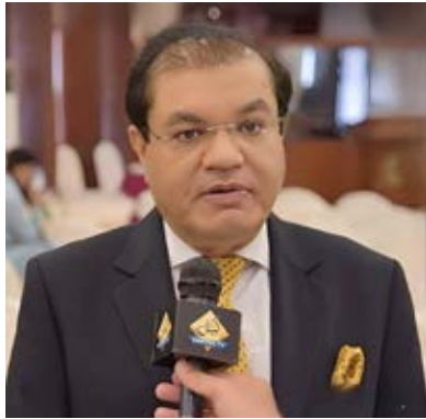
The current visit, after the Iran-US conflict, signals intent to move beyond announce-

Hussain said historical and geographic proximity must now become economic partnership in trade, gas pipeline, energy, border connectivity, and private-sector collaboration. During Pezeshkian's 2025 visit, 12 MoUs were signed and a $10 billion bilateral trade target was set, up from $3 billion.