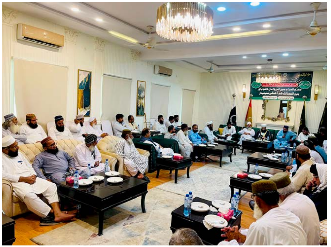
armed forces and law enforcement to ensure peaceful Muharram observances and promote interfaith harmony nationwide.