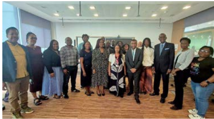
By celebrating the borough's rich diversity and shared hope to continue building a more cohesive, compassionate, and united Newham for all residents.