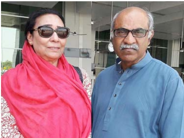
welfare. The budget lacks a strategy for broadening the tax base, documenting the economy, or reducing external

The party is concerned about the rising national debt, which diverts funds from education, healthcare, employment, research, and social