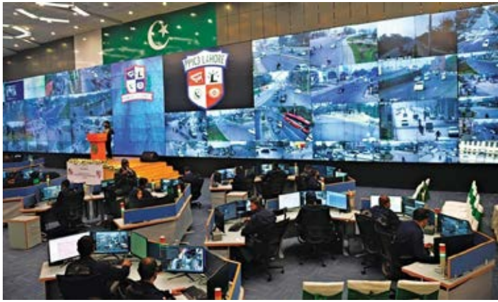
Information Minister Azma Bokhari instructed Deputy Commissioners and District Police Officers to coordinate with procession organizers and ensure

Ministers Azma Bokhari, Bilal Akbar Khan, and Special Assistant Zeeshan Malik attended, later visiting the Central Imambargah and procession routes. The Faisalabad Commissioner and RPO briefed the committee on the comprehensive security plan being implemented.