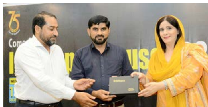
the ceremony that ICMA is becoming a landmark in Pakistan and developed countries. Today, it has completed 75 years