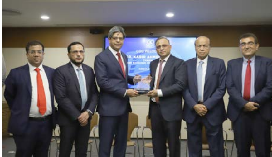
The meeting reviewed CDCPL's operational performance, technological infrastructure, cybersecurity framework, digital transformation initiatives, and strategic plans aimed at further strengthening Pakistan's capital market ecosystem.