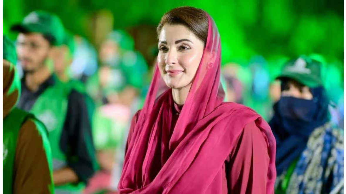
and installing new High Efficiency Irrigation Systems (HEIS) powered by solar energy.

She noted that fertile lands across the world were turning into deserts due to climate change and human activities. Under the Resilient and Inclusive Agriculture Transformation (PRIAT) programme, the government was improving water conveyance systems