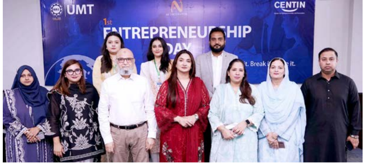
She also appreciated UMT's efforts in promoting research, innovation and strengthening academia-industry link-