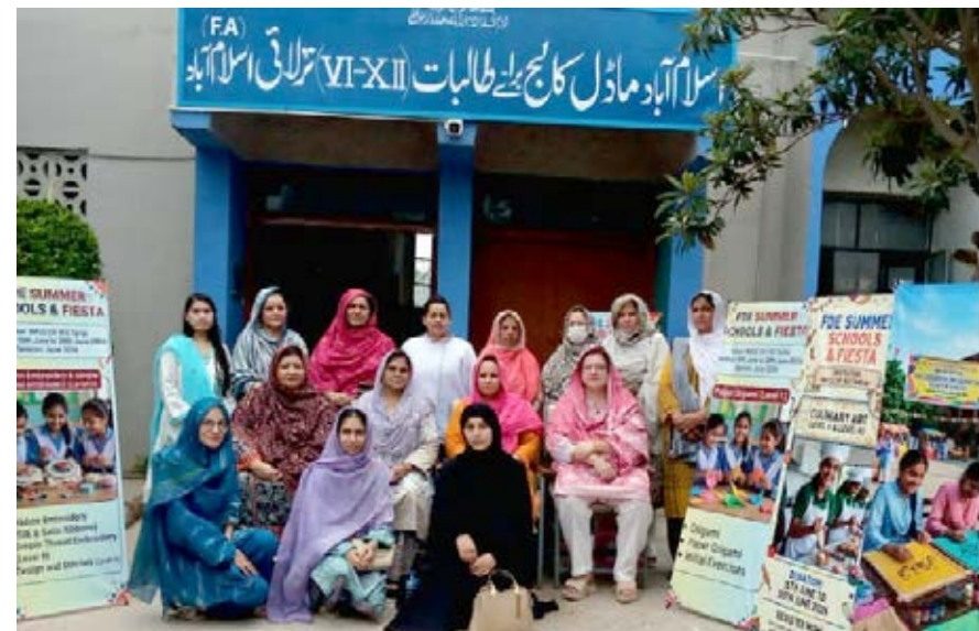
emphasized the importance of such programs in nurturing student talent and providing enriching learning experiences beyond the traditional classroom.