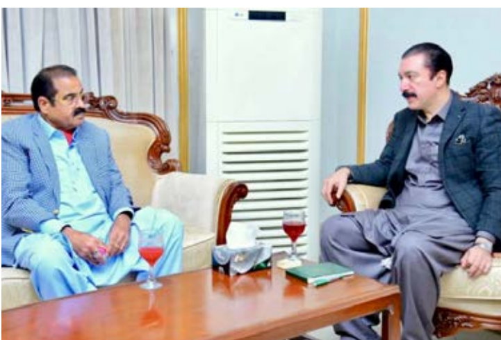
regarding refugee seats.

He noted that 37 out of 38 demands from a banned committee have been met and suggested constitutional and legal avenues for resolving issues