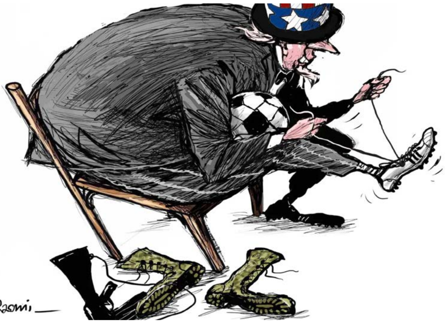
Cartoon by Amjad Rasmi. (Courtesy of Ashraf Al-Awdat)

Experts now call for integrated watershed management, wetland restoration, better water governance, stricter environmental law enforcement, and greater community participation to safeguard Pakistan's wetlands and migratory species.