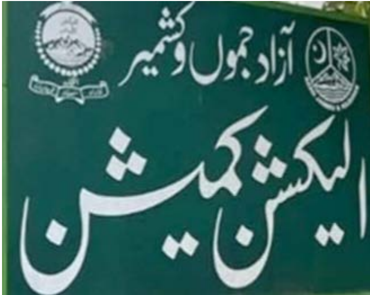
Azad Jammu and Kashmir Election Commission to take timely and effective steps for the conduct of elections.

As per Article (4)22 of the Azad Jammu and Kashmir Interim Constitution, 1974, general elections to the Legislative Assembly must be held within sixty (60) days before the end of the constitutional term of the Assembly, while the election results must be declared at least fourteen (14) days before the end of the term of the Assembly. The first session of the current Assembly was held on August 03, 2021. Therefore, it was the constitutional responsibility of the