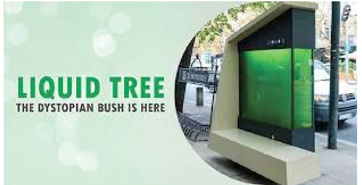
that artificial trees in large plazas and commercial areas will improve environment just like real trees.

She underscored that "Liquid Tree" is a modern scientific method of removing carbon dioxide from the environment through a bioreactor by growing algae in water; as this method is the most advanced scientific approach to eliminating carbon dioxide and smog in cities. She flashed