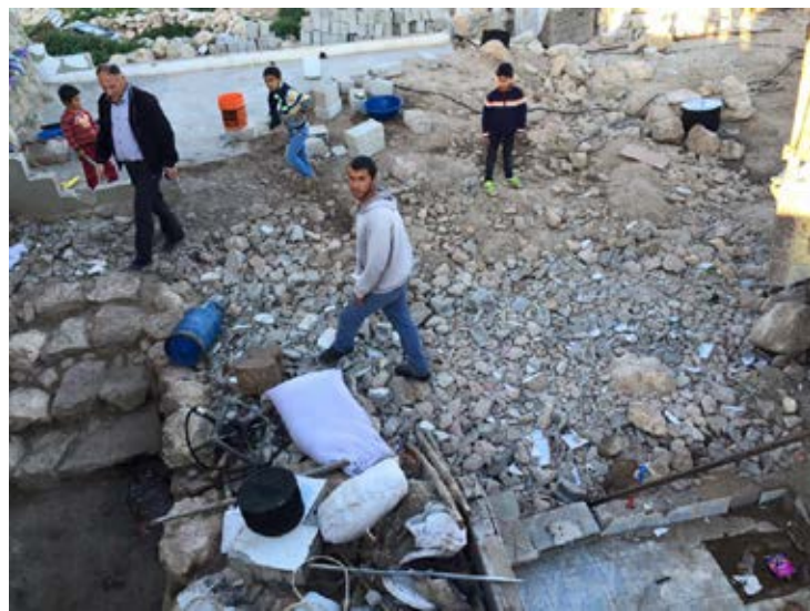
Israel's ongoing violations against the Palestinian people.

The targeted homes and structures shelter nearly 100 Palestinians, and their demolition would forcibly displace residents and deprive them of their basic rights, marking yet another instance of forced displacement amid