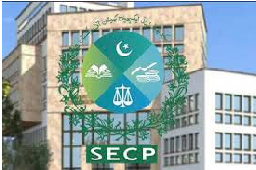
The information technology, trading, and services sectors led these new registrations, with a combined paid-up capital of Rs67 billion. SECP's initiatives to enhance the ease

The corporate sector also experienced substantial expansion, with 31,986 new companies incorporated, bringing the total to 294,101.