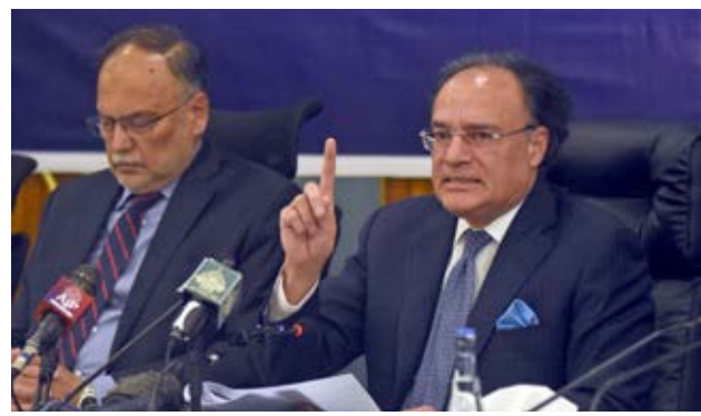
"The survey is not just an economic document but a story

The minister, accompanied by Federal Minister for Planning, Development and Special Initiatives Professor Ahsan Iqbal, Federal Minister for Information and Broadcasting Attaullah Tarar, Minister of State for Finance and Revenue Bilal Azhar Kayani and senior officials from the Ministry of Finance and Revenue, highlighted key economic indicators and performance.