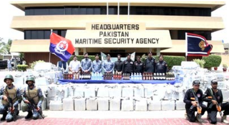
the effectiveness of inter-agency coordination in countering smuggling while highlighting the resolve of Pakistan Navy to deny use of sea for illicit activities.

The consignment was being transported from international destinations via sea to Pakistan. The recovered contraband has been handed over to Excise, Taxation & Anti Narcotics Department (South Zone) Balochistan for further legal proceedings. The successful operation underscores