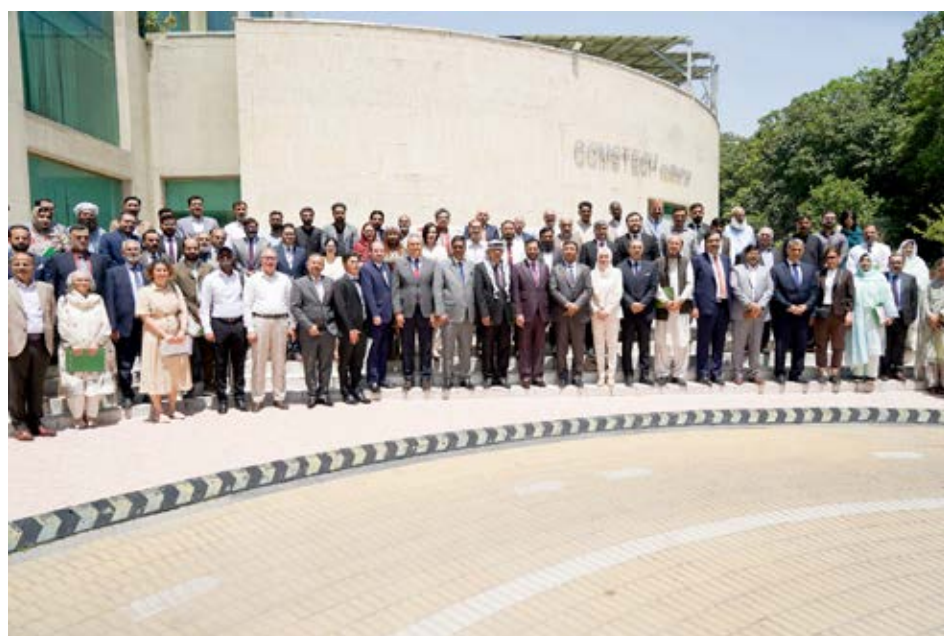
copoeia for Pakistan.

The event provided a platform for dialogue among stakeholders and contributed to the development of short-, medium- and long-term policy recommendations aimed at strengthening Pakistan's herbal and traditional medicine sector. Discussions also supported ongoing efforts towards the documentation and standardization of herbal medicines and the development of a comprehensive Herbal Pharma-