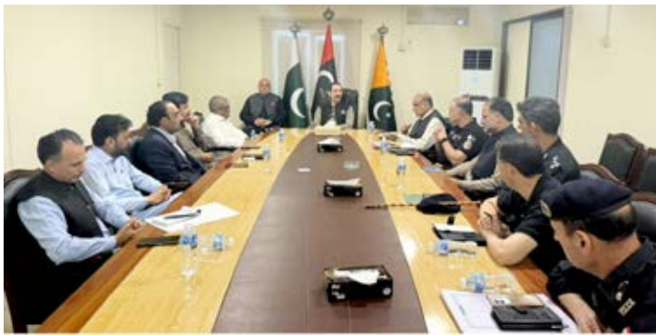
Azad Jammu and Kashmir, protecting the lives and property of the people and ensuring the security of government properties. Prime Minister Faisal Mumtaz Rathore directed that force should be used only against mischief-

The meeting discussed issues related to maintaining peace and order in