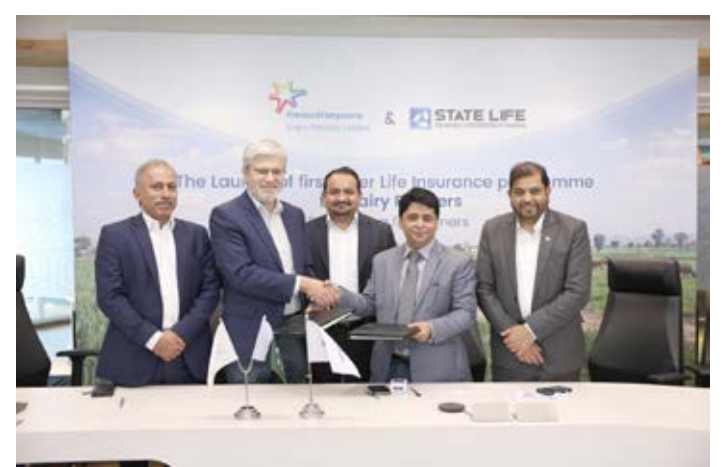
future for the country's agricultural economy.

This initiative underscores the joint vision of FrieslandCampina Engro Pakistan Limited and State Life Insurance Corporation of Pakistan to create a lasting impact beyond business, ensuring to build a more resilient, inclusive, and sustainable