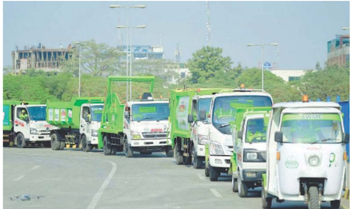
scale initiative involving billions of rupees, advanced technology, and a massive work-force, must deliver 100pc results.

The meeting concluded with a reaffirmation that Suthra Punjab, now a large-