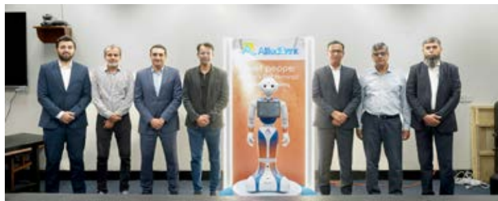
Associate Professor and Director, CHISEL Lab at LUMS, in the presence of representatives from both institutions. "Partnering with Allied Bank enables