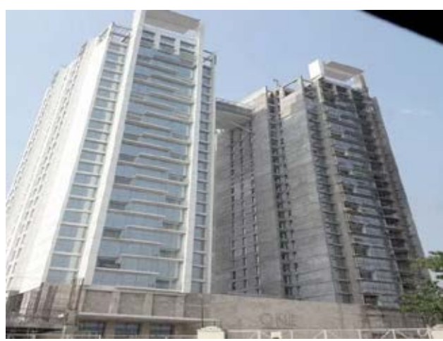
The meeting was also attended by the Secretary Cabinet Division and Secretary Commerce, who are members

The law minister noted that the committee was fully aware of the written decision issued by the Islamabad High Court regarding the matter.