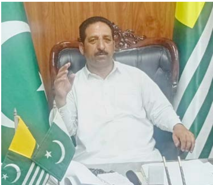
deserve appreciation for prioritizing dialogue over deadlock.

He said that President of Pakistan Asif Ali Zardari, Prime Minister Mian Muhammad Shehbaz Sharif, Chief of Defence Forces Hafiz Syed Asim Munir, national security institutions, and the Awami Action Committee