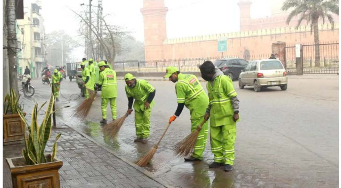
throughout Eid-ul-Adha, providing citizens with a cleaner, safer, and more secure environment.

The spokesperson concluded that joint efforts of Punjab Safe Cities Authority and Suthra Punjab played a vital role in maintaining cleanliness, public safety, and essential civic services throughout Eid-ul-Adha, providing citizens with a cleaner, safer, and more secure environment.