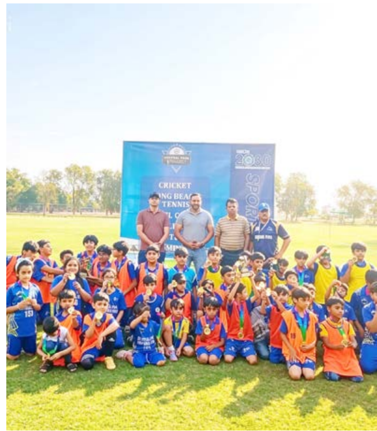
sports staff, and all concerned departments.