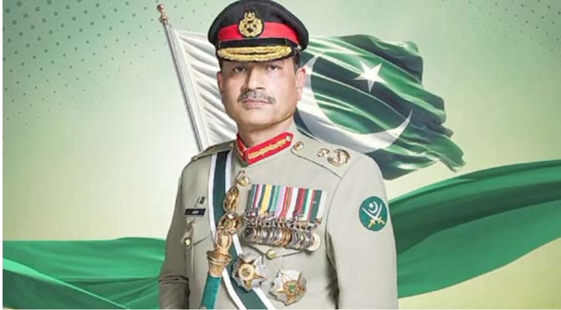
On this blessed occasion, special Shuhada-e-Pakistan whose unparalleled sacrifices continue to strengthen the foundations of the nation. Pakistan Hamesha Zindabad

Eid-ul-Azha symbolizes sacrifice, faith, and solidarity. The Pakistan Armed Forces remain steadfast in their sacred duty to defend the sovereignty and territorial integrity of the country and stand shoulder to shoulder with the nation in pursuit of peace and stability.