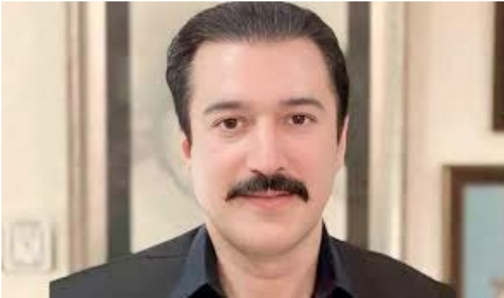
He also paid tribute to Kashmiris for their unwavering commitment and resilience in the face of Indian state terrorism. Referring to the Indian government's

He said that people of Kashmir, who have rendered immense sacrifices, were upholding the same spirit of sacrifice while facing Indian repression.