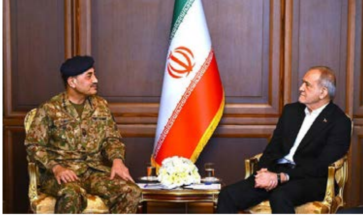
reportedly took place.

During the visit, the Pakistani military leadership held meetings with Iranian President Masoud Pezeshkian, Foreign Minister Abbas Araghchi, and the Speaker of Parliament, where detailed and productive discussions