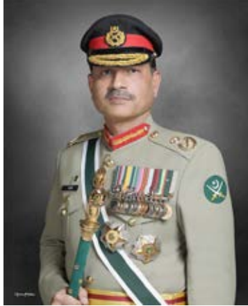
leadership for review.

The report further said that following Field Marshal Asim Munir's return from Tehran, the proposed draft was forwarded to the Iranian and American