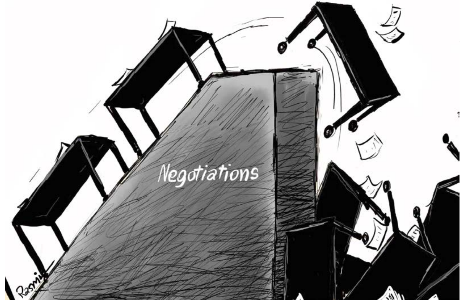
Cartoon by Amjad Rasmī. (Courtesy of Ashraf Al-Azmat)

This diplomatic balancing act significantly elevated Pakistan's global standing. While India increasingly aligned itself with Israel and adopted highly confrontational regional postures, Pakistan emerged as a state capable of engaging multiple rival camps simultaneously — Washington, Tehran, Beijing, Riyadh, Ankara, and the Gulf monarchies. The contrast between Pakistan's mediation role and India's increasingly polarized image became increasingly visible during