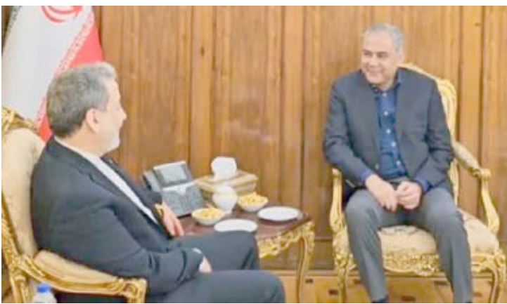
President Donald Trump and Iranian officials.

Conversely, Iran's Foreign Ministry spokesperson stated that Tehran is reviewing the American position and reiterated demands for the release of frozen assets and the lifting of US port blockades.