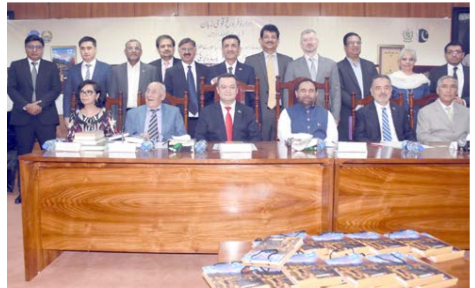
Particular interest was

generated by the "Dictionary of Common Words in Uzbek and Urdu Languages," which contains approximately 4,000 words reflecting the centuries-old historical, cultural, and linguistic ties between our two nations.