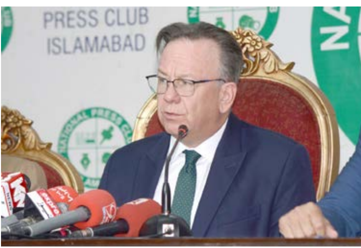
economic, and strategic cooperation. Discussions on counter-narcotics, law enforcement, and illegal migration were also noted following Interior Minister Naqvi's meetings in Warsaw. Economically, bilateral trade between Poland and

He described Poland-Pakistan relations as "warm, friendly, and steadily expanding," citing recent high-level exchanges, including the Polish Foreign Minister's visit to Pakistan, which have opened new avenues for political,