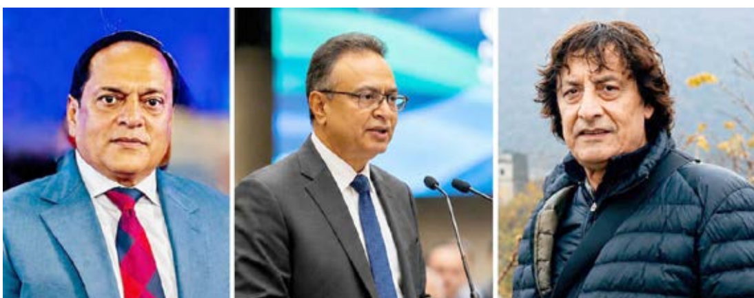
Interactive sessions and networking aim to foster constructive dialogue and encourage fresh perspectives.