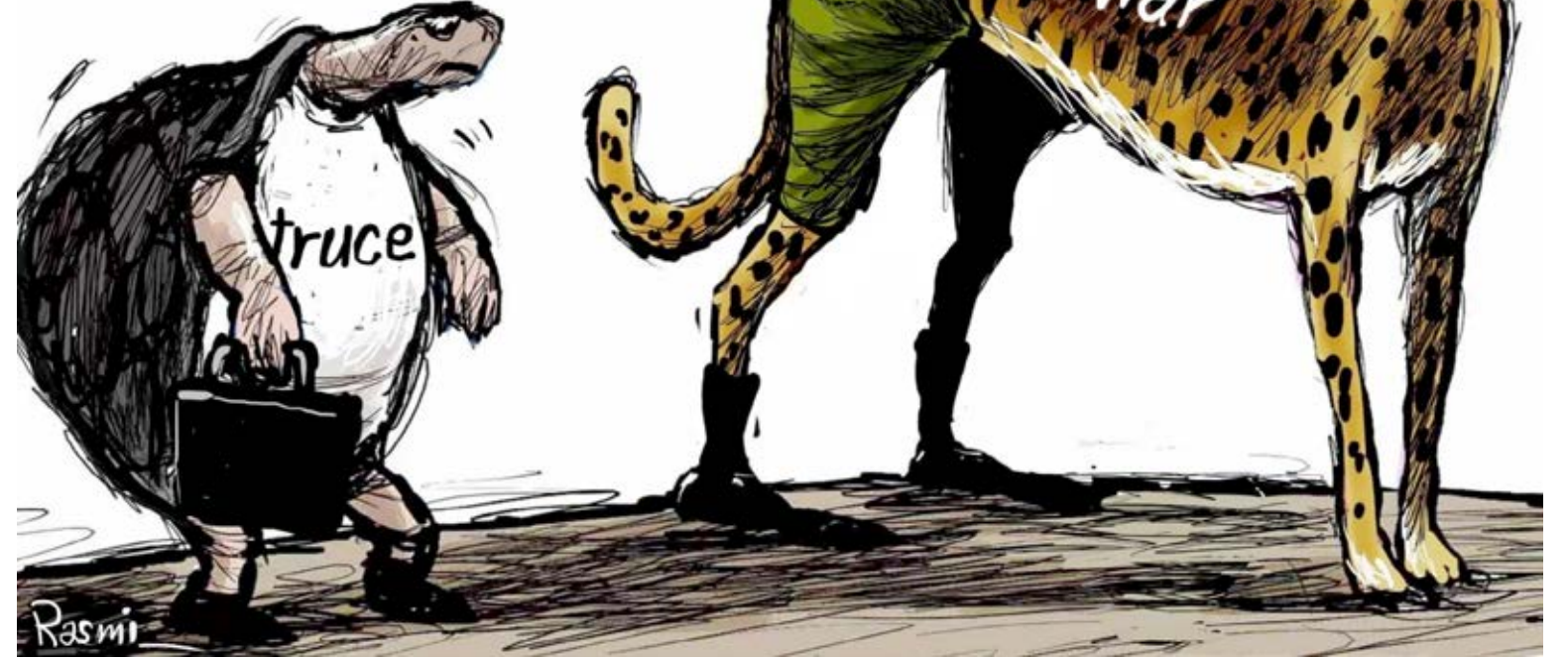
Cartoon by Amjad Rasmi. (Courtesy of Ashfaq Al-Awsat)

Trump's shifting statements have further deepened uncertainty and added volatility to US policy. Rising tensions in this strategic passage have also unsettled the international community, with even America's close allies showing reluctance to fully endorse escalation, reflecting growing war fatigue across diplomatic circles. Meanwhile, Russia and China have played quiet but significant roles in shaping the narrative, with China—heavily dependent on energy flows through Hormuz—advocating regional stability and jointly proposing a five-point peace plan with Pakistan that has drawn international attention. Russia's use of veto power at the UN also signals its unwillingness to allow Iran's isolation, highlighting a broader divide in global alignments and reinforcing the emerging multipolar character of the conflict.