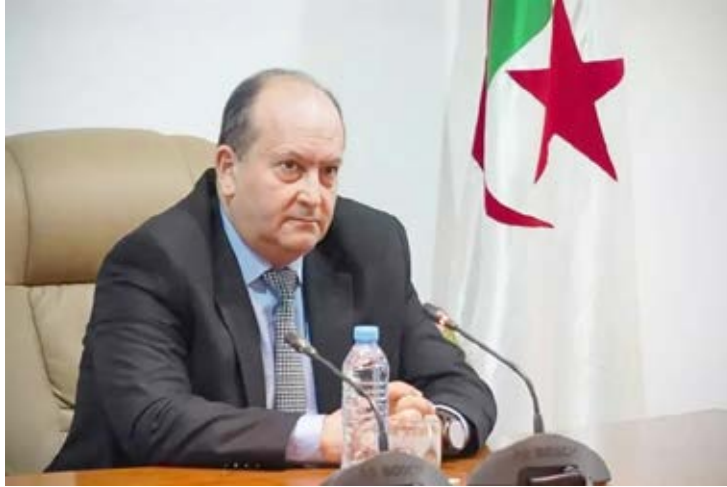
Algerian Prime Minister Sifi Gharib

The new reform is based on addressing the root causes of the problem by making the Algerian Investment Promotion Agency the sole and exclusive point of contact for investors. Representatives of various departments within the one-stop shops will no longer be mere intermediaries transferring files to their respective departments, but will instead become fully empowered