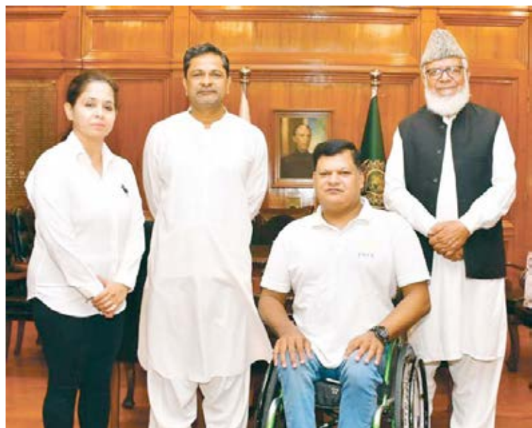
patiating teams and tournament organisers. He added that Karachi would be beautifully decorated to welcome the visiting teams and that guests would receive