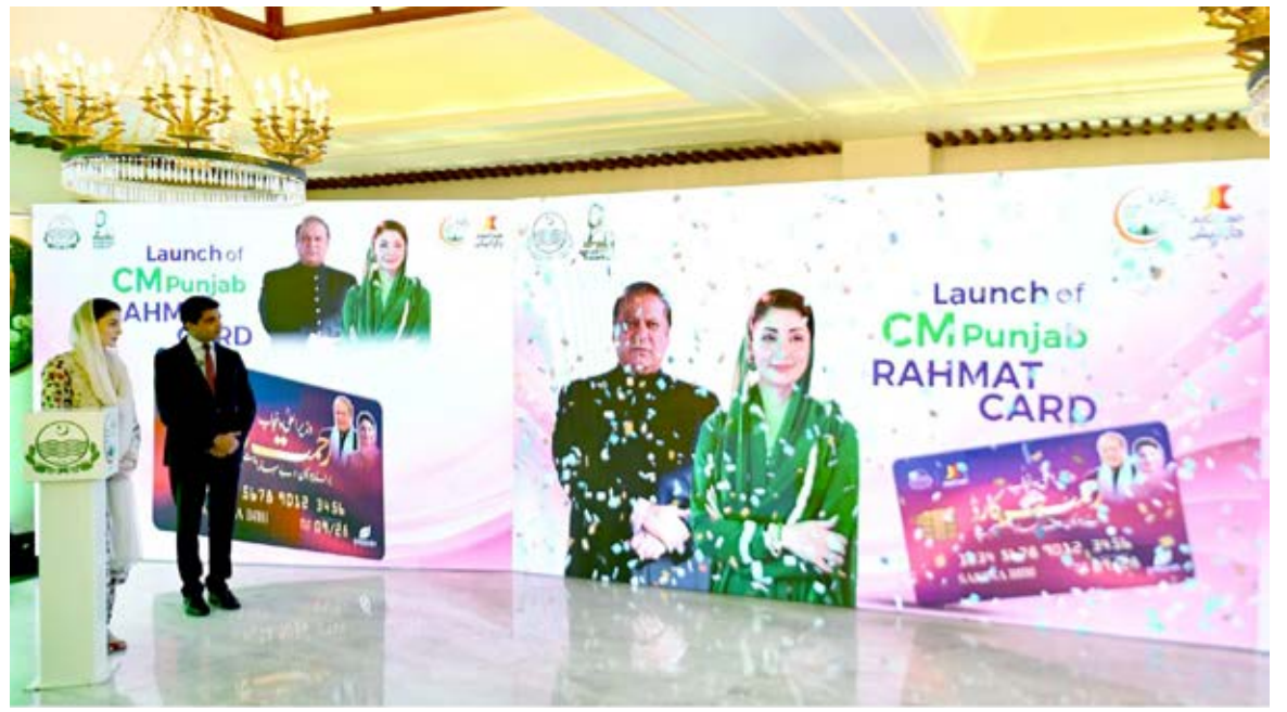
The chief minister further said it is her desire that no widow or orphan in Punjab should feel helpless or unsupported, adding that the government believes in public service rather than traditional politics.

She said the objective of the "CM Punjab Rehmat Card" programme is to ensure social dignity and economic empowerment of the deserving segments of society. The initiative has been launched under the guidance of Nawaz Sharif, she added, expressing the resolve to continue expanding such welfare efforts.