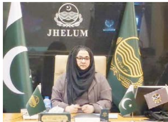
tion is taking all legal steps to ensure the availability of high-quality agricultural inputs to farmers at official rates. ADCR Saneeca Safi mobilized the anti-adulteration

During the meeting, the supply and pricing of fertilizers and pesticides across the district were reviewed in detail. The ADCR emphasized that the District Administration