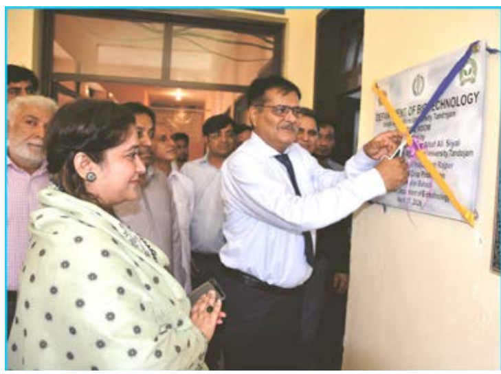
pressure, particularly Cotton Leaf Curl Virus (CLCV).

HYDERABAD: In a significant step towards climate-smart agriculture, the Sindh Agriculture University (SAU) Tandojam in collaboration with the private sector is conducting advanced field experiments on climate-resilient cotton varieties aimed at addressing the growing challenges of climate change, water scarcity, and rising temperatures in Sindh.