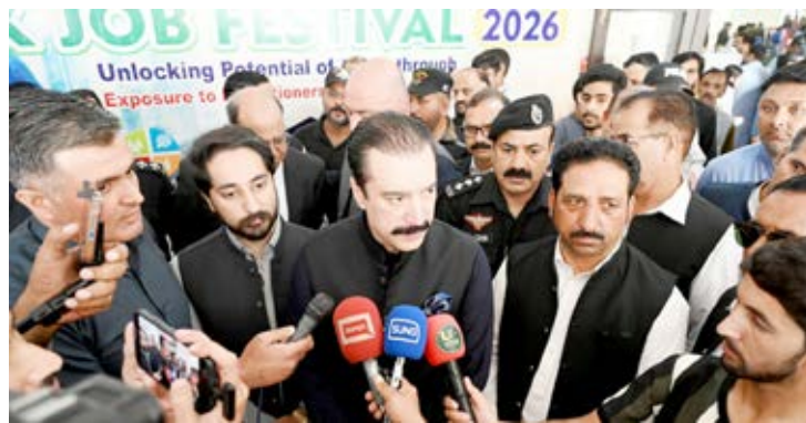
lation comprises youth, the AJK premier stressed the need to channel their energies into productive activities.

Speaking to the media during his visit to the Azad Jammu and Kashmir Job Festival, he said the initiative aimed to equip youth and job seekers with training, career counselling and insights into evolving market demands. Noting that nearly 64 per cent of the popu-