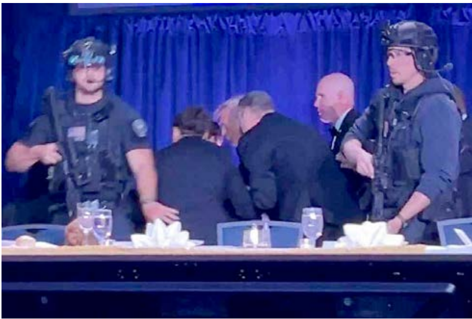
in federal court on Monday with assault of a federal officer, discharging a firearm and attempting to kill a federal officer, Blanche said, adding he did not know if there was an Iran connection to the attack.