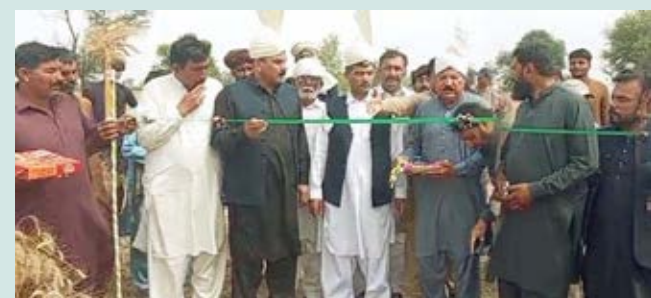
Wheat Harvesting Ceremony held at Toba Tek Singh Research Farm.