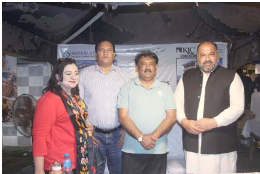
the live performance of Music Concert and liked the different food and other stalls.