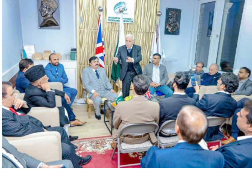
The Minister underscored that Pakistan is

Speaking on the occasion, the Federal Minister appreciated the vital role played by the Pakistani business community abroad in strengthening Pakistan's economic footprint globally. He highlighted the Government's investor-friendly policies and reiterated Pakistan's commitment to facilitating foreign investment, improving ease of doing business, and fostering international partnerships.