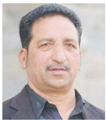
exemplary role in providing relief to the people from the outdated system

Riaz, Acting President Chaudhry Latif Akbar, paid tribute to the guidance of Party President Chaudhry Muhammad Yasin and congratulated the nation. Appreciating the long-term strategy of Prime Minister Raja Faisal Mumtaz Rathore for countering the palace conspiracies of political opponents in the approval of the education package with wisdom and wisdom, it is a national breakthrough for the new generation. Spokesperson for the Prime Minister Shaukat Javed Mir said that education, health, employment, provision of infrastructure, social justice, supremacy of merit, good governance, corruption, recommendation commissions have played an