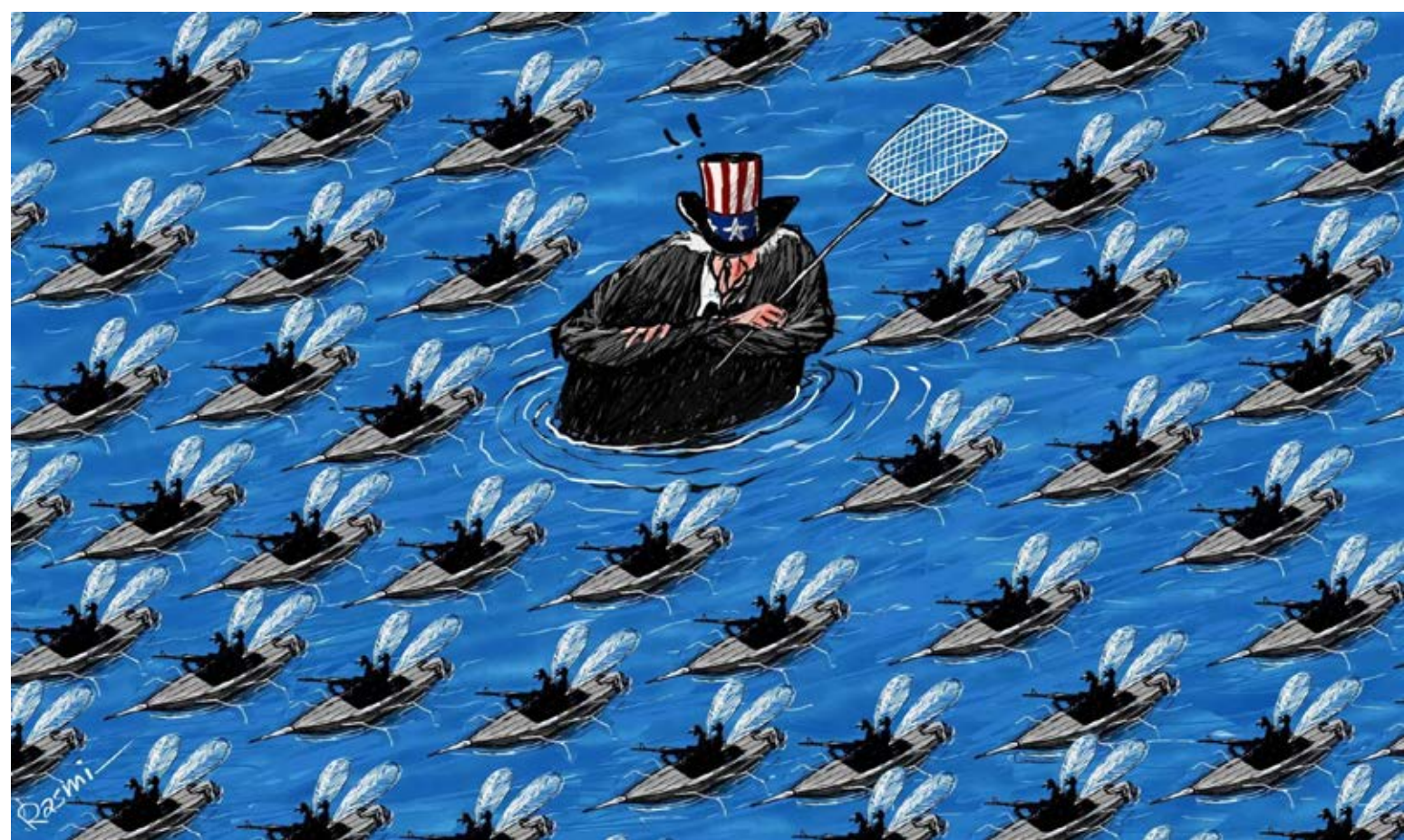
Cartoon by Amjad Rasmī.

World Immunization Week 2026 serves as a renewed call for action for parents, caregivers, community leaders, health workers, media, and all stakeholders to play their role in ensuring that every child is fully immunized. By making informed decisions and prioritizing vaccination, we can protect our children, families, and future generations.