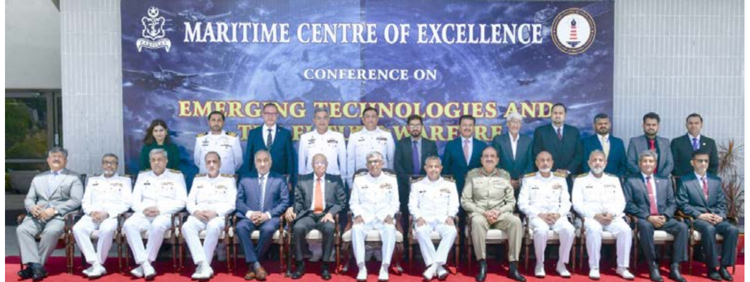
need for sustained intellectual synergy to navigate technology-driven transformations to harness future trends in warfare.

The event was attended by senior military leadership, policymakers, diplomats, academia, industry experts and students from various universities. It concluded with a reaffirmation of the