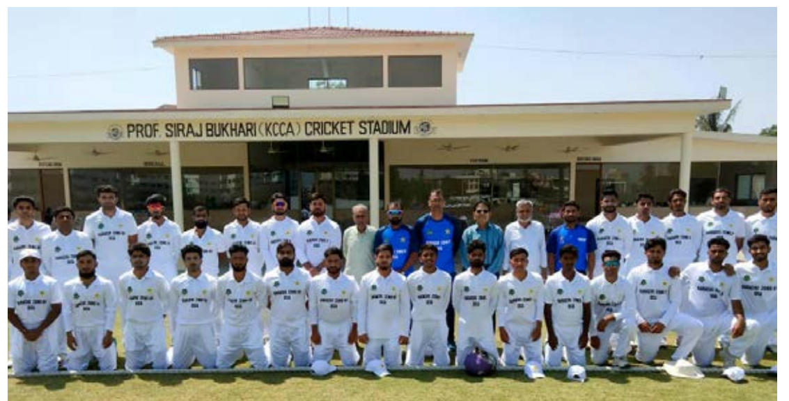
1) Zone-I vs Zone-V at Baqai Cricket Ground. 2) Zone-II vs. Zone-VII at UBL Sports Complex. Zone-III. vs. Zone-VI at KCCA Stadium.