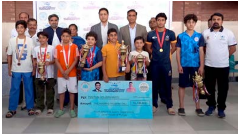
Group Swimming Championship.