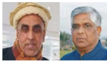
any other political force.

The role that the Muslim Conference has played in the development and prosperity of the people of Azad Kashmir has not been matched by