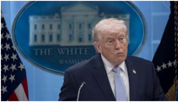
"Effective immediately, the United States Navy, the Finest in the World, will begin the process of BLOCKADING any and all

While acknowledging that the marathon negotiations in Pakistan had gone "well" and "most points were agreed to," Trump said Tehran had refused to concede on the issue of its nuclear program.