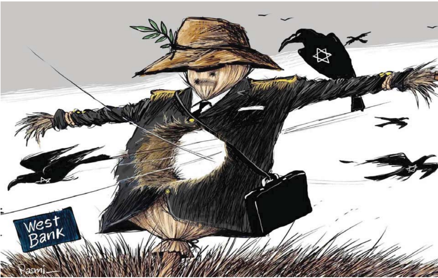
Cartoon by Amjad Rasmī.