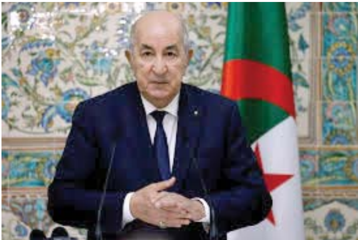
hood of Pakistan to face this calamity and ensure security, security and stability prevail in their country." "The President of the People's Demo-

ISLAMABAD: The President of the Democratic People's Republic of Algeria Mr. Abdul Majeed Taboun sent a message of condolences, sympathy to the President of the Islamic Republic of Pakistan Mr. Asif Ali Zardari, following the suicide bombing that occurred in the Khadija Grand Mosque in the Tarlay Kalan area of the capital Islamabad, while performing Friday prayer on February 6, 2026, which dozens after The dead and the wounded President Abdul Majeed Taboun asserted his Pakistani counterpart, "This despicable criminal act, which is at odds with our permissible Islamic values, will only increase the strength, stability and cohesion of the brother-