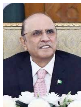
of the late leader as valuable.

The President also expressed his condolences to the bereaved family, while describing the national and political services