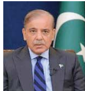
leader in the form of Barrister Sultan Mahmood Chaudhry."

The PM said, "Today, the people of Azad Jammu and Kashmir have lost a great