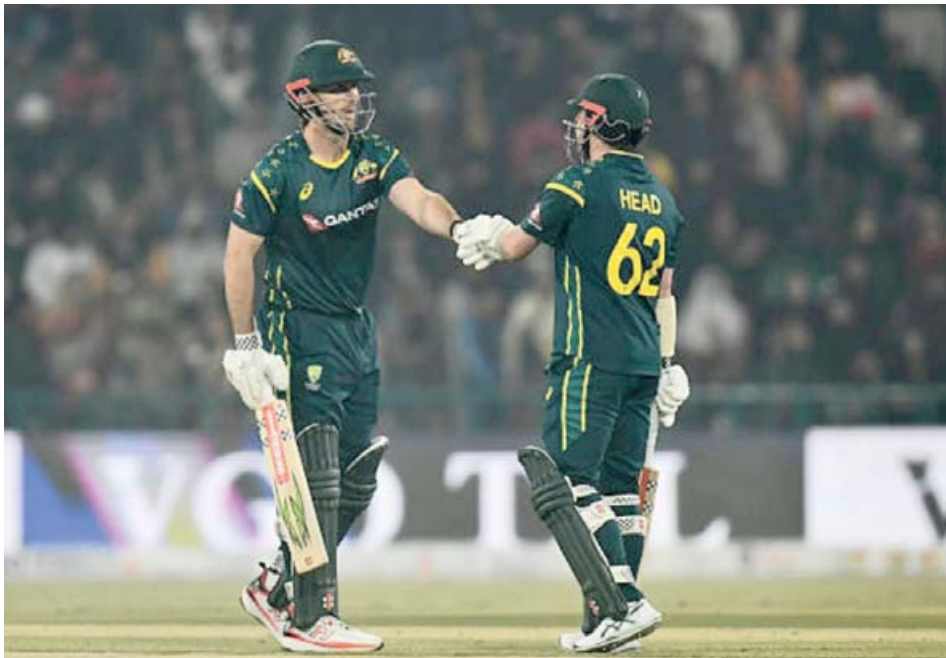
Marsh scored 18 runs. Travis Head could only score four runs. Cameron Green scored 35 and Matthew Short scored 27. Pakistan has won the three-match series by 2-0. The last match of the series will be played tomorrow at the Gaddafi Stadium in Lahore.