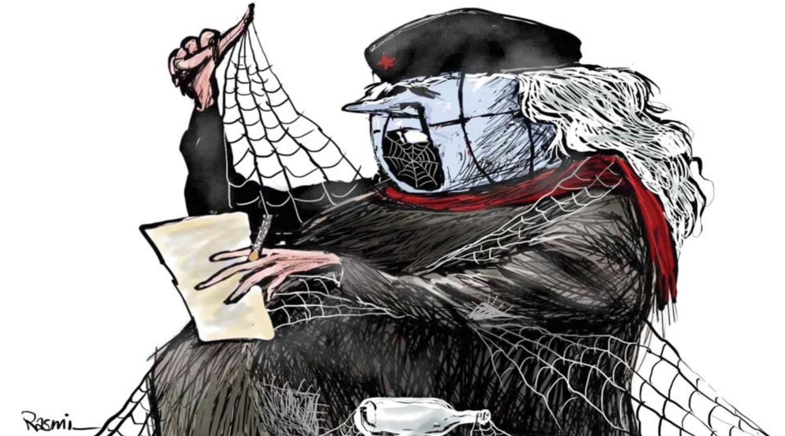
Cartoon by Amjad Rasmi. (Courtesy of Ashfaq Al-Awdat)

In the end, the true test of leadership will not be measured by the number of ships deployed or the range of missiles at the ready, but by whether this moment of tension becomes another chapter in a long history of devastation or a turning point toward a more durable, if imperfect, equilibrium. The stakes are not just regional. They are global, and they will be felt in the lives of millions who have no voice in the decisions now being made over the waters of the Gulf. The writer is Press Secretary to the President (Rtd), Former Press Minister, Embassy of Pakistan to France, Former Press Attaché to Malaysia and Former MD, SRBC. He is living in Macomb, Michigan