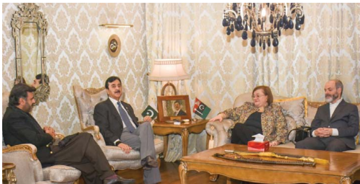
Participants stressed the need to further strengthen bilateral ties, promote cultural heritage protection, expand workforce exchange between Pakistan and Italy, enhance economic cooperation and