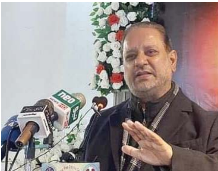
In his message Sardar Attique Ahmed Khan said that Indian atrocities

DHIRKOT: President of All Jammu and Kashmir Muslim Conference and former Prime Minister Sardar Attique Ahmed Khan has said that October 27, 1947 is the darkest day in the history of the state of Jammu and Kashmir, the day on which India launched aggression and barbarity in occupied Jammu and Kashmir, against which Kashmiris living all over the world are observing Black Day against India's illegal occupation. The Kashmiri people have been struggling for the recognized right to self-determination for the past seven decades. The Muslim Conference will continue its struggle until the independence of occupied Kashmir and its accession to Pakistan. The United Nations should play a role in resolving the Kashmir issue.