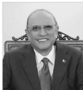
ASIF ALI ZARDARI

President of the Islamic Republic of Pakistan