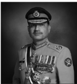
FIELD MARSHAL SYED ASIM MUNIR NISHAN-E-IMTIAZ (MILITARY) HILAL-E-JURAT

Defence Minister of the Islamic Republic of Pakistan