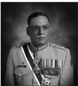
GEN. SAHIR SHAMSHAD MIRZA NISHAN-E-IMTIAZ (MILITARY)

Chairman Joint Chiefs of Staff Committee