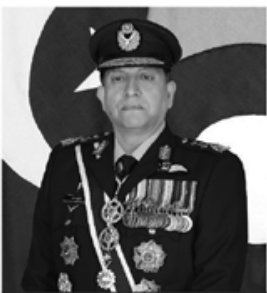
AIR CHIEF MARSHAL ZAHÉER AHMED BABER SIDHU NISHAN-E-IMTIAZ (MILITARY) HILAL-E-JURAT