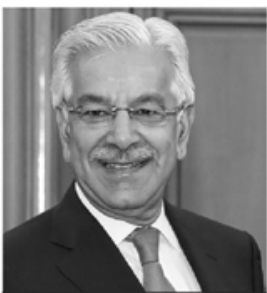
KHAWAJA M. ASIF

Deputy Prime Minister/Minister for Foreign Affairs of the Islamic Republic of Pakistan