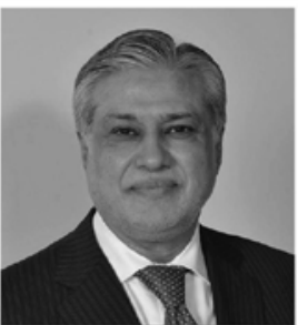
M. ISHAQ DAR

Prime Minister of the Islamic Republic of Pakistan