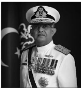
ADMIRAL NAVEED ASHRAF NISHAN-E-IMTIAZ (MILITARY) TAMGHA-E-BASALAT

Chairman Joint Chiefs of Staff Committee