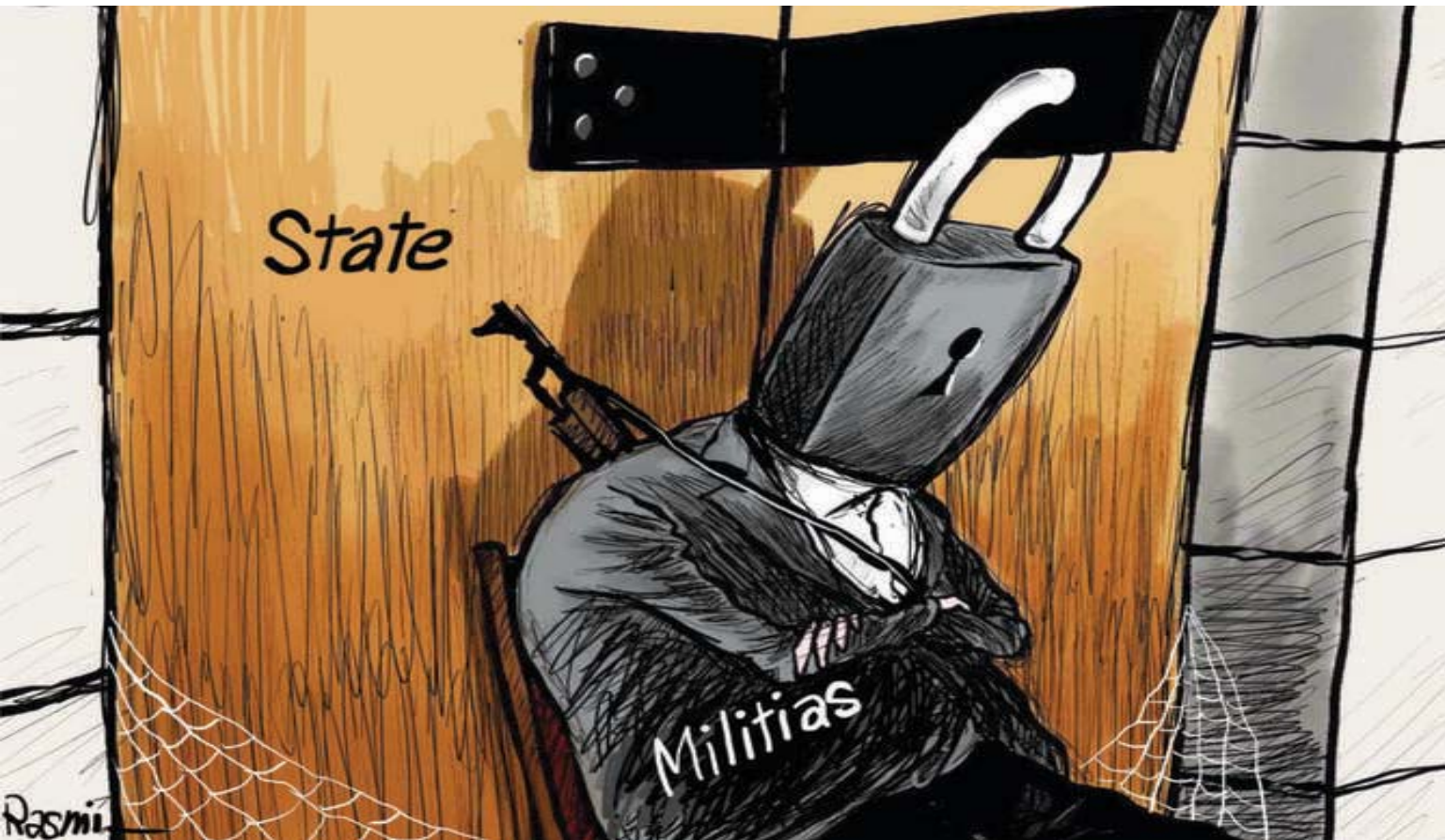
Cartoon by Amjad Rasmī.