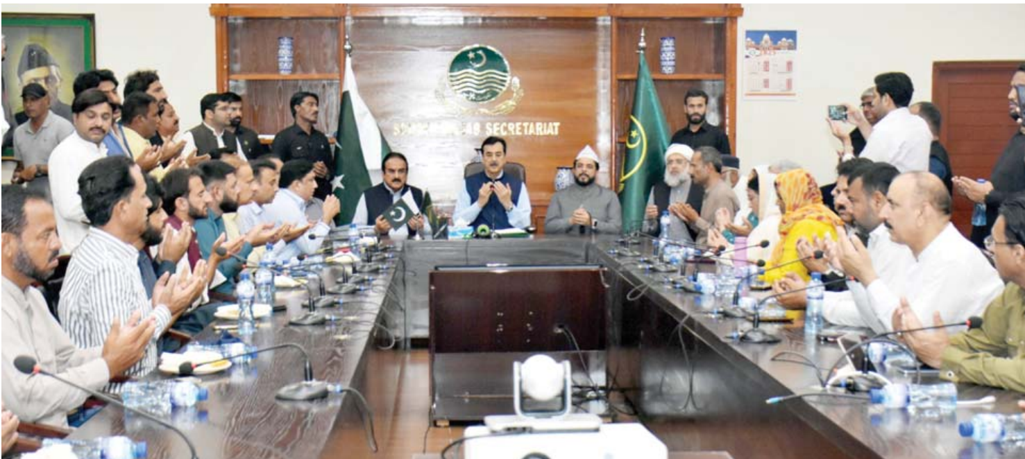
Eid Milad-un-Nabi ﷺ celebrations for the past century, and this year the event is being observed at the official level as well.

Highlighting Multan's cultural and religious traditions, the Senate Chairman pointed out that Anjuman Islamia Multan has been organizing