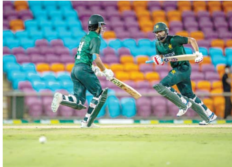
the same venue. The first ball of the match will be bowled at 4pm local time.

Shaheens will now face Scorchers in their next match on Saturday, August 16 at