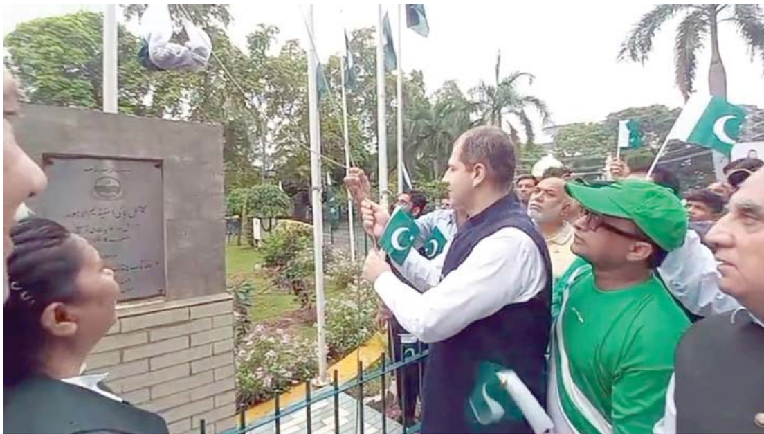
SBP XI and Directorate XI in which SBP XI defeated Directorate XI by

In the women hockey match, Pakistan Green XI emerged winners against Pakistan White XI by a narrow margin of 2-1 goals. The Independence Day cricket match was played between