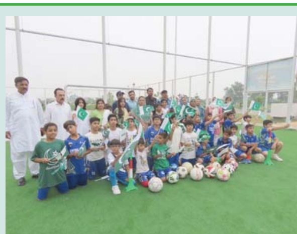
Central park Sports Department Celebrating the 78 independence day and organized different types Sports Activity in Central park Housing society sports Complex

Across the country, streets and neighbourhoods were adorned with green and white flags. At Shakarparian Parade Ground, military equipment used in Marka-e-Haq was put on public display.