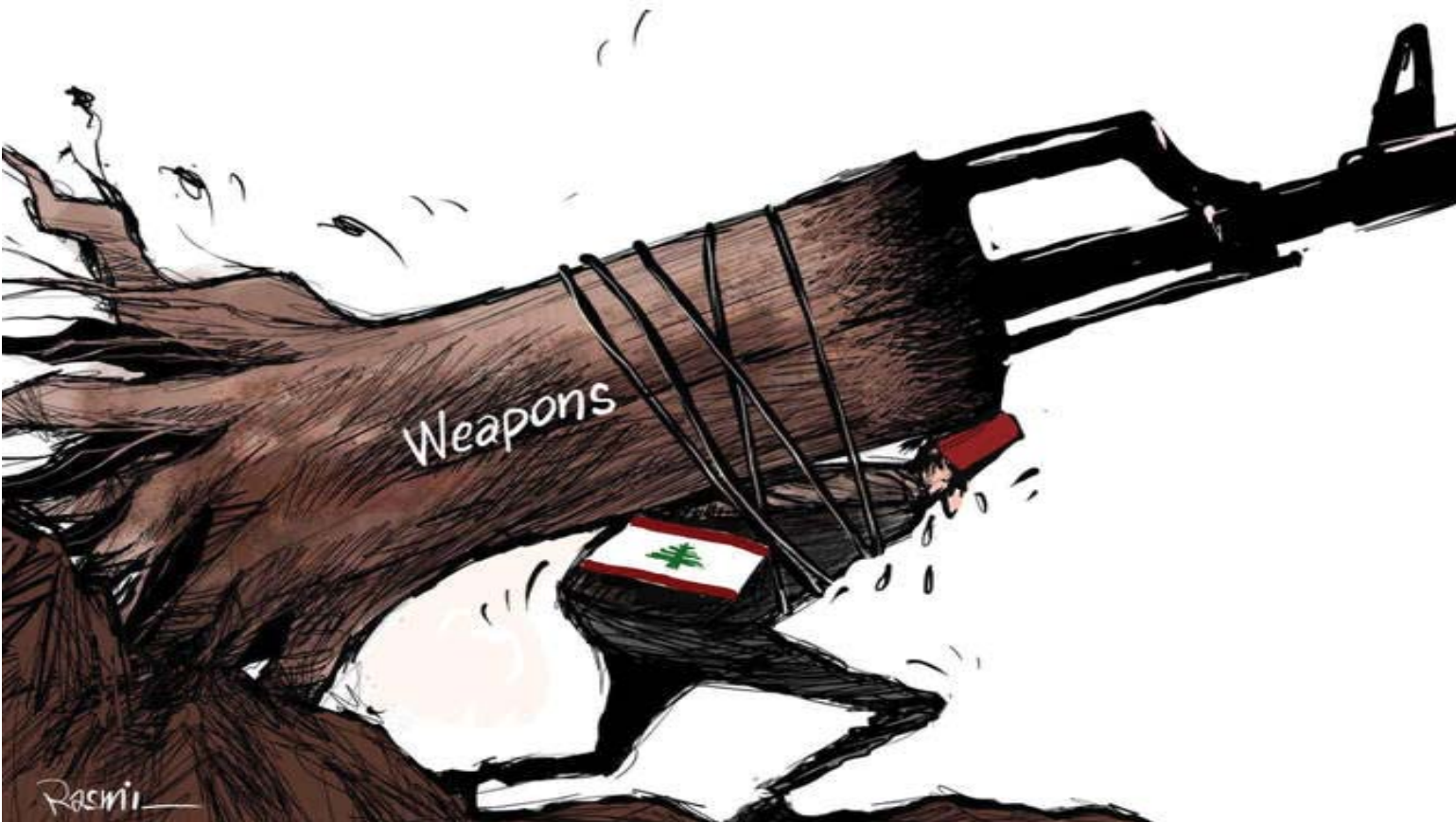
Cartoon by Amjad Rasmi.

And this is the true message of Independence Day.