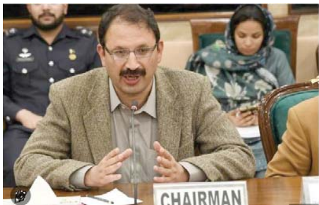
had purchased properties in Portugal and were preparing

On Aug 6, Defense Minister Khawaja Asif levelled serious allegations against Pakistan's bureaucracy, claiming that more than half of them