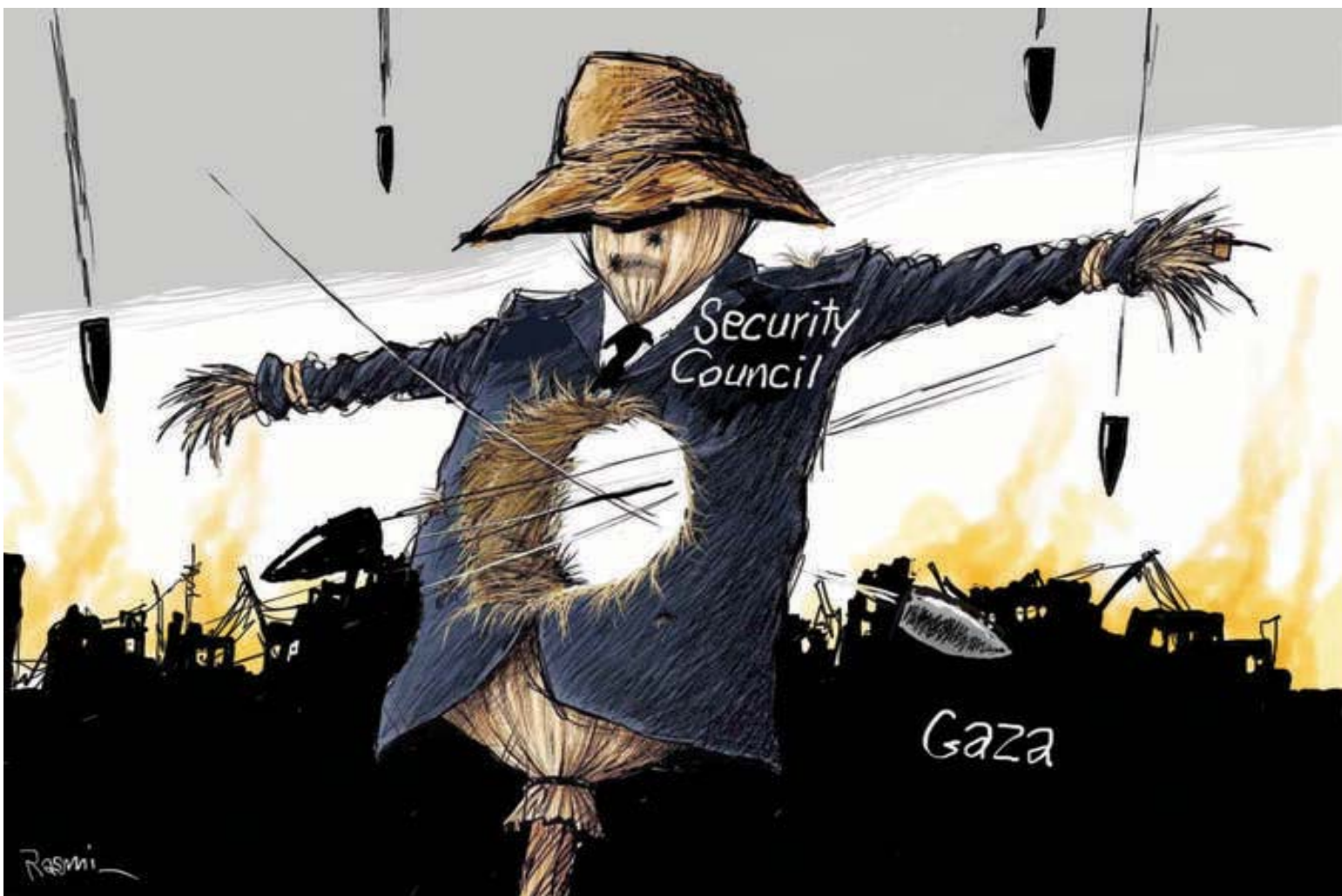
Cartoon by Amjad Rasmi.

The Pakistan Air Force (PAF) stands as a profound source of national pride for the people of Pakistan, whose trust in its unwavering dedication and exceptional capabilities for safeguarding the homeland is absolute. There is a deep-seated conviction across the nation that, with such courageous and outstanding armed forces, no external power would dare to harbor malicious intentions or cast an aggressive gaze upon Pakistan. The PAF’s remarkable service record, from its pivotal role in defending national airspace and delivering decisive strategic blows to its crucial contributions in humanitarian crises and its consistent pursuit of technological excellence, has cemented its place not just as a military branch, but as a revered symbol of national strength, resilience, and sovereignty. This collective belief in the PAF’s formidable presence underscores a powerful sense of security and unity among Pakistanis, who view their air force as an invincible shield against any form of aggression, ensuring the dignity and integrity of their beloved motherland.