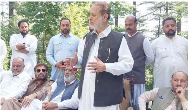
said that Muslim Conference workers should display Pakistani flags on

RAWALPINDI/MUZAFFARABAD: President of All Jammu and Kashmir Muslim Conference and former Prime Minister of Azad Kashmir Sardar Attique Ahmed Khan has said that August 14, Independence Day, is not just a historical day but a practical expression of the Kashmiri nation's love and attachment to Pakistan. The entire Kashmiri nation should celebrate this day in a dignified manner and hoist the green crescent flag on every street, neighborhood and house to send a message to the world that the Kashmiri people consider their destiny to be linked to Pakistan. He