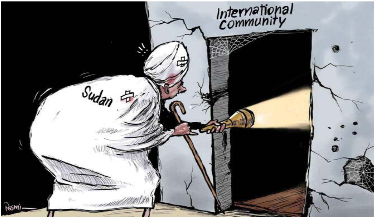
Cartoon by Amjad Rasmī.

The future of Kashmir is tied to its past, and in that past lies the undeniable truth that Pakistan is the natural, spiritual, and strategic homeland for the Kashmiri people. Independence may sound appealing in theory, but in the shadow of a hostile and expansionist neighbor like India, it is a fragile illusion. Accession to Pakistan, on the other hand, is the realization of a long-held dream, the culmination of generations of struggle, and the only path that ensures survival with dignity. Pakistan has proven again and again, whether in diplomacy, on the battlefield, or through humanitarian solidarity, that it is the only true well-wisher of the Kashmiri people. The choice is clear, the vision is defined, and the goal remains firm in the hearts of millions: the ultimate destiny of the Kashmiri people is accession to Pakistan.