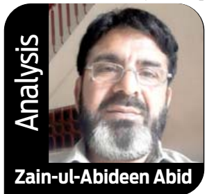
Analysis Zain-ul-Abideen Abid

It is also a well-acknowledged fact that eliminating phatta rickshaws will significantly reduce accidents, improve traffic flow, ease urban life, and help clear congested roads. For the progress and safety of the city, every citizen must respect traffic laws and fully support this action. Although delayed, this step against illegal transport is a much-needed move in the right direction.