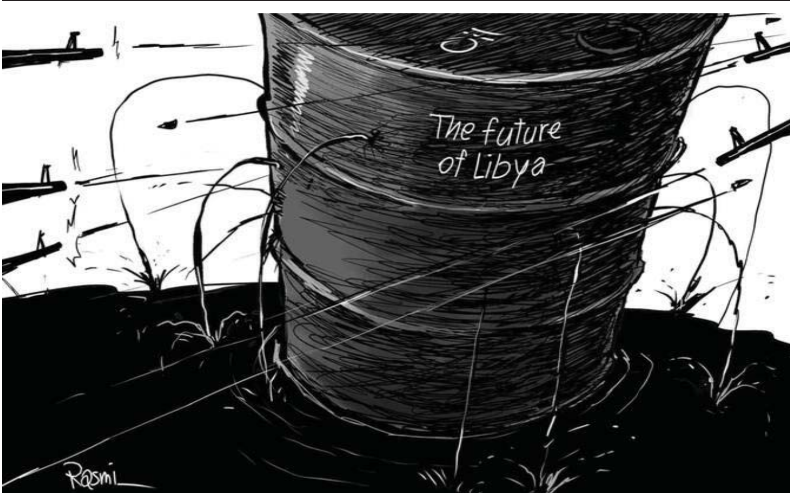
Cartoon by Amjad Rasmi.

The people of Pakistan, especially the youth, view the Pakistan Army as a source of national pride and the true defender of the state. They strongly reject any propaganda against the military and deeply appreciate its countless contributions to the country’s progress and well-being.